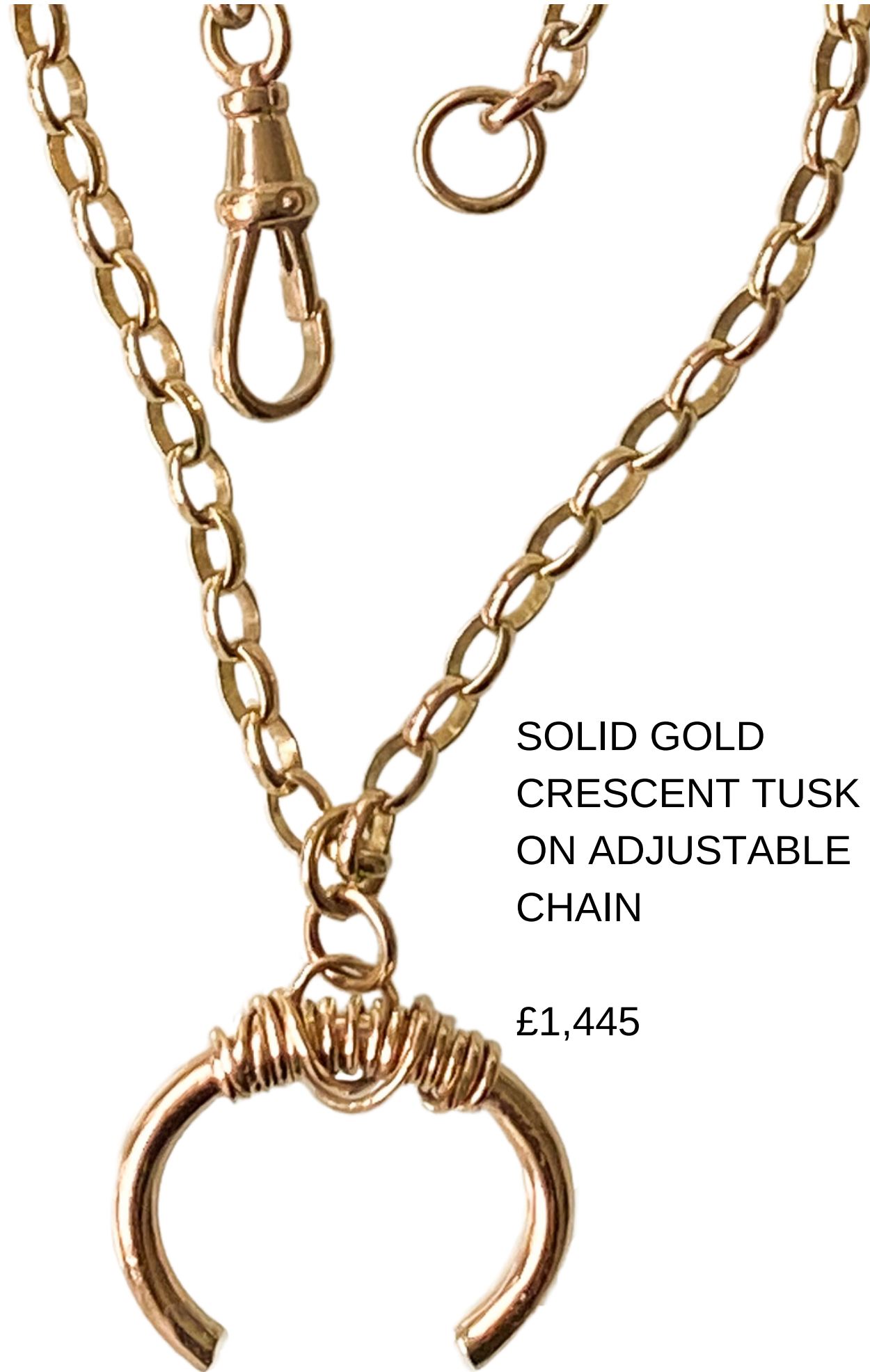
SOLID GOLD CRESCENT TUSK ON ADJUSTABLE CHAIN