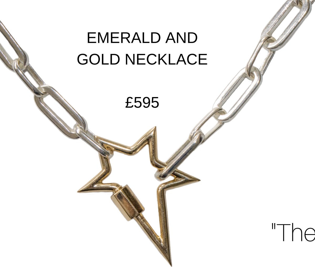
EMERALD AND GOLD NECKLACE