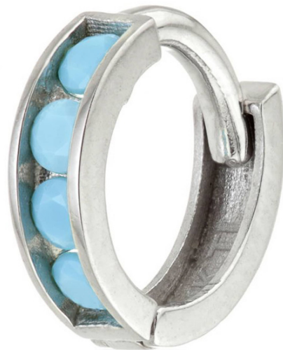
WHITE GOLD TURQUOISE HUGGIE HOOP