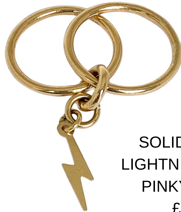
SOLID GOLD LIGHTNING BOLT PINKY RING £380