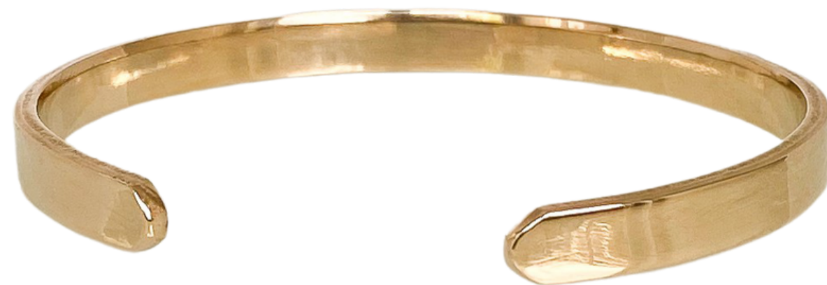
SOLID GOLD CUFF BRACELET. MADE FROM 100% RECYCLED GOLD.