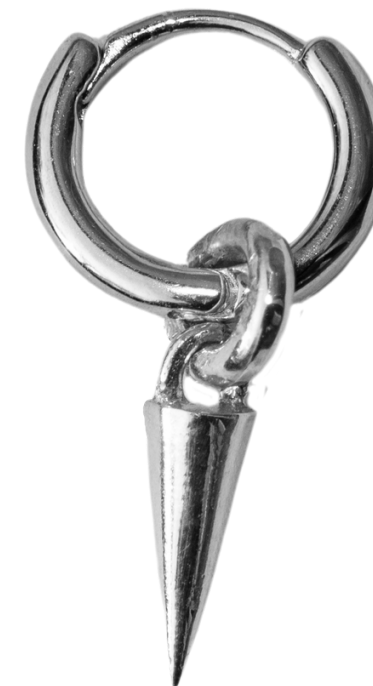
SILVER HANDCAST SPIKE HOOP EARRING