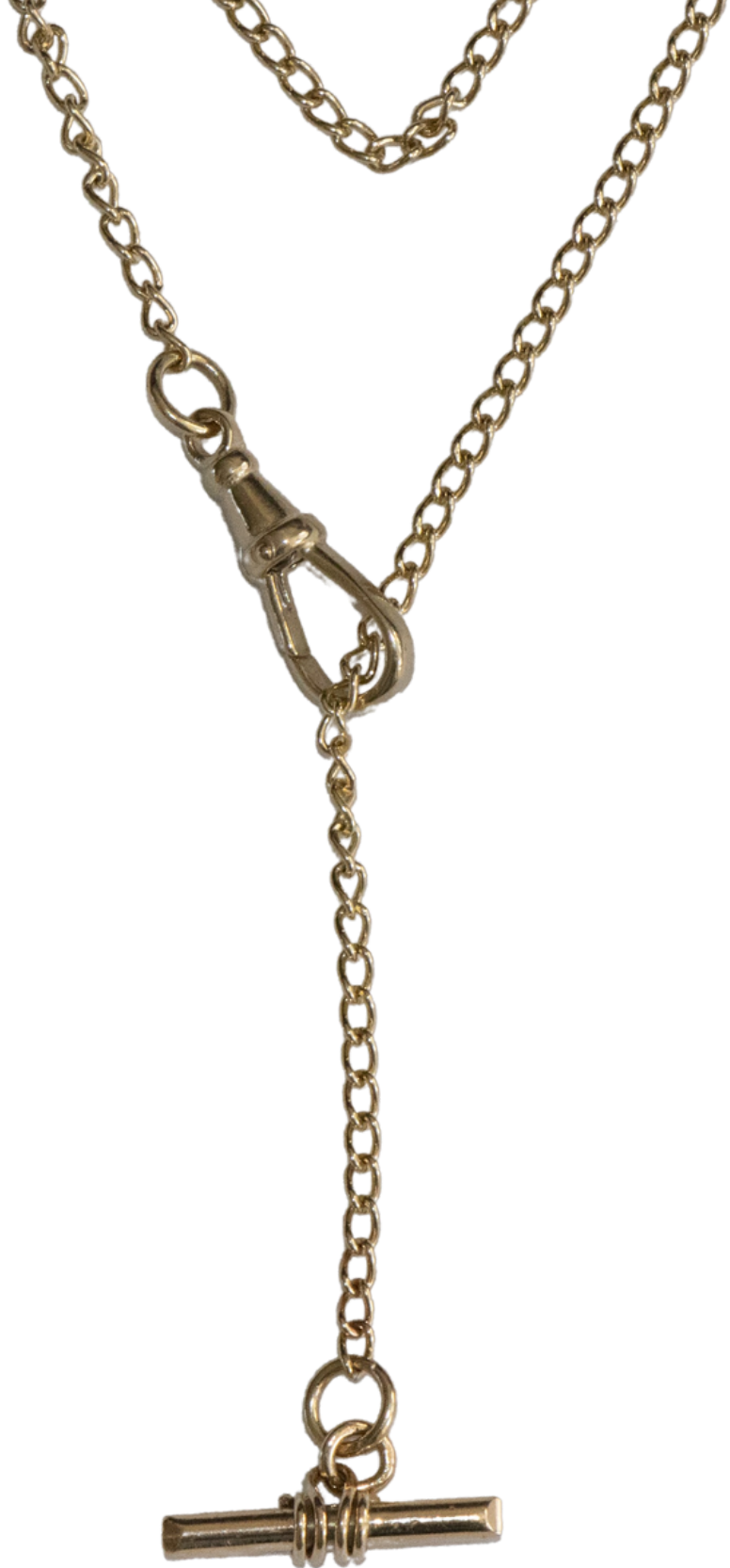
SOLID GOLD WARRIOR LARIAT