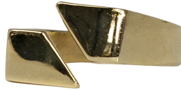
SOLID GOLD SPLIT SIGNET RING £345

"Absolutely stunning. I never take it off"