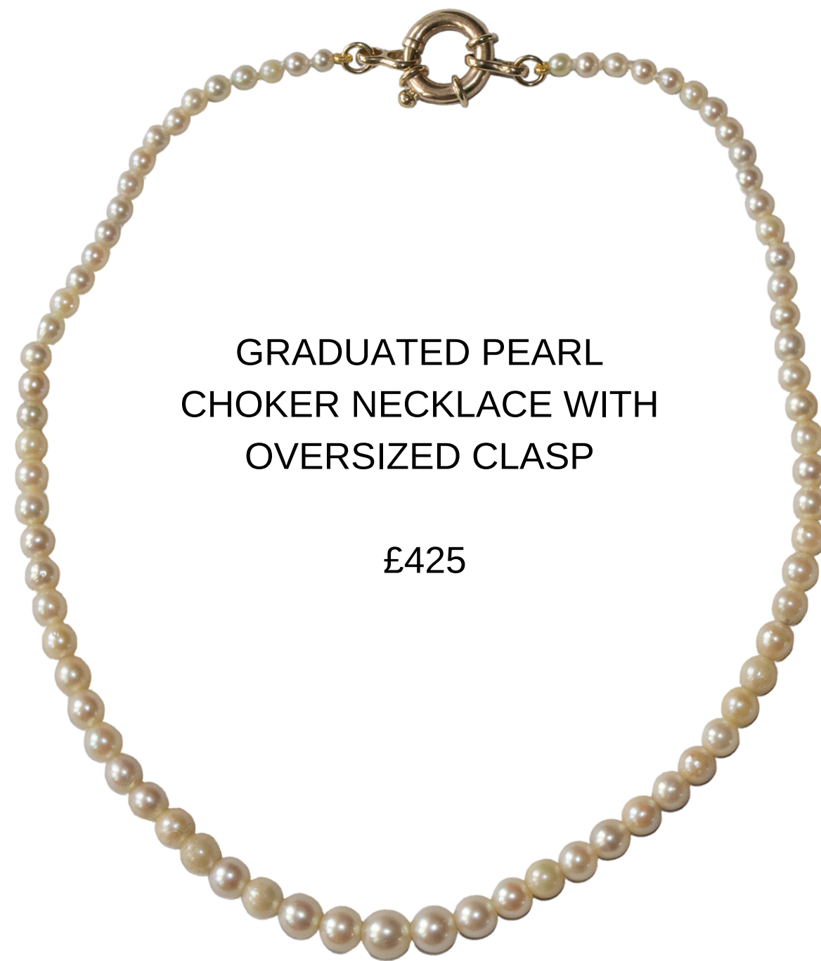
GRADUATED PEARL CHOKER NECKLACE WITH OVERSIZED CLASP