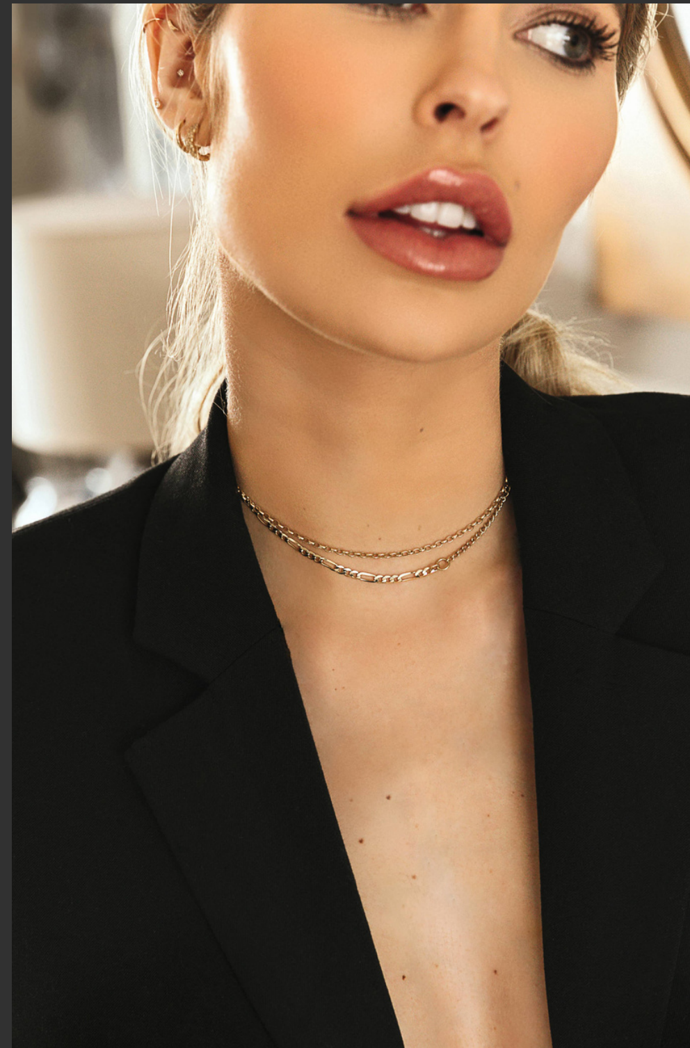
LONG SOLID GOLD MIXED-LINK CHAIN