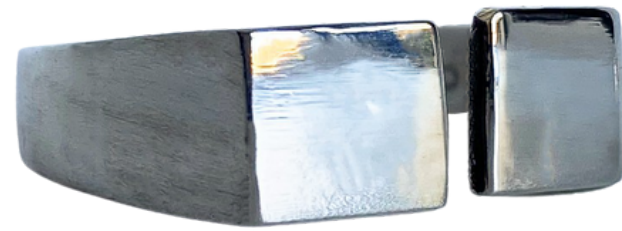
SILVER SPLIT SIGNET RING £95