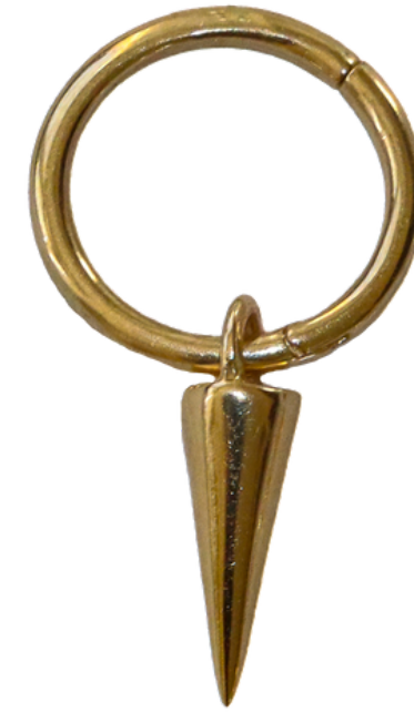
SOLID GOLD HANDCAST SPIKE HOOP EARRING