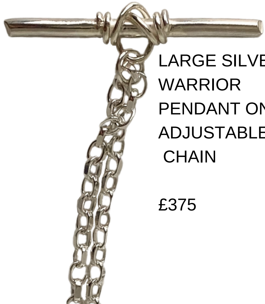
LARGE SILVER WARRIOR PENDANT ON ADJUSTABLE CHAIN