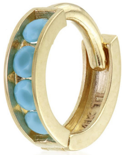
YELLOW GOLD TURQUOISE HUGGIE HOOP £75