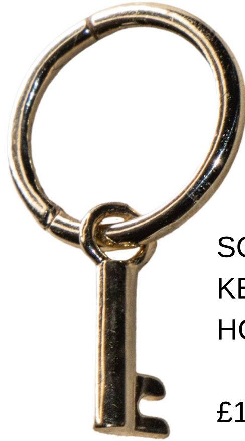
SOLID GOLD KEY CHARM HOOP EARRING

In March 2021, LUCILLE LONDON partnered with TISH LYON®, UK luxury piercing jewellery manufacturer, to offer a selection of body jewellery.