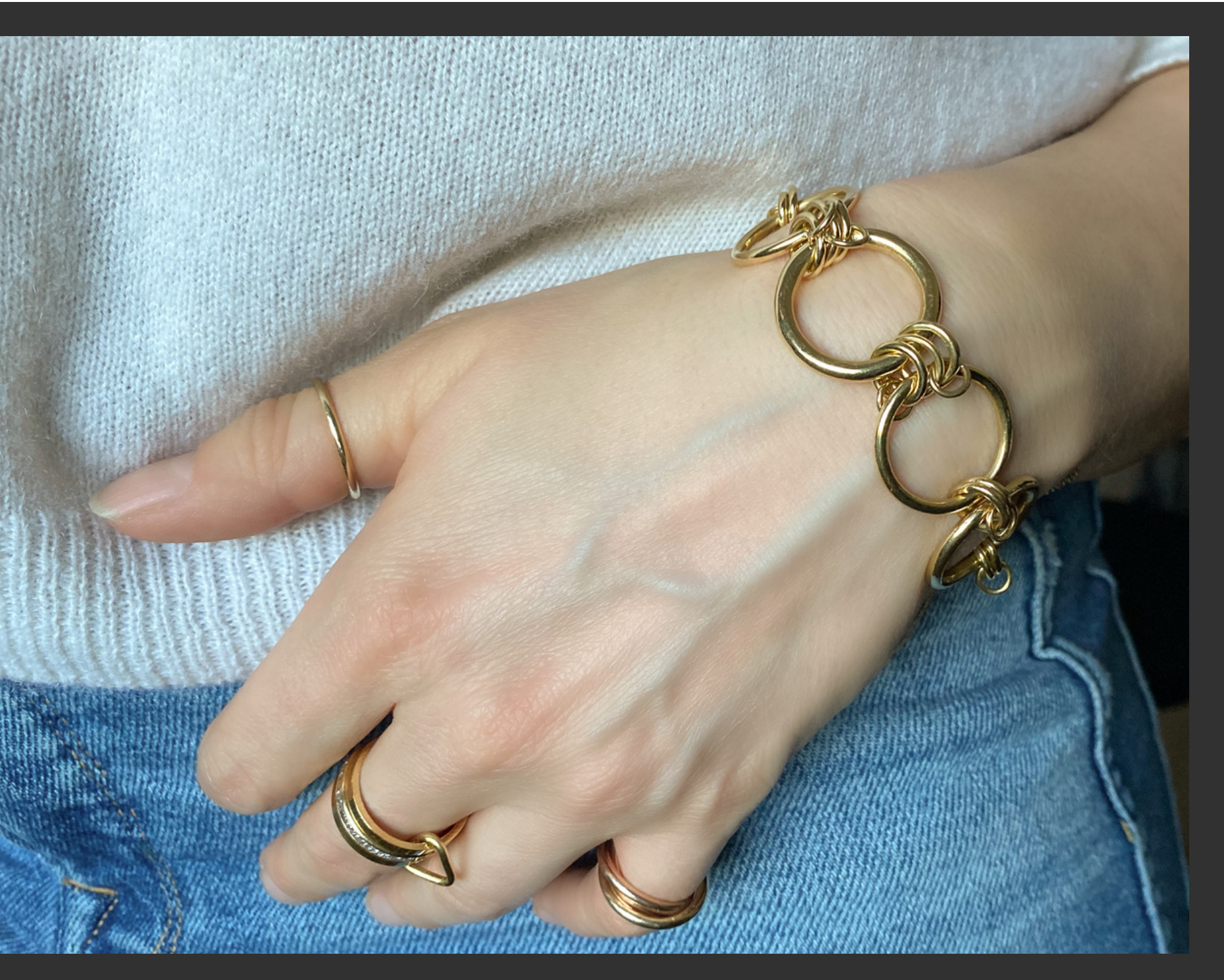
18CT GOLD LARGE LINK CHUNKY BRACELET