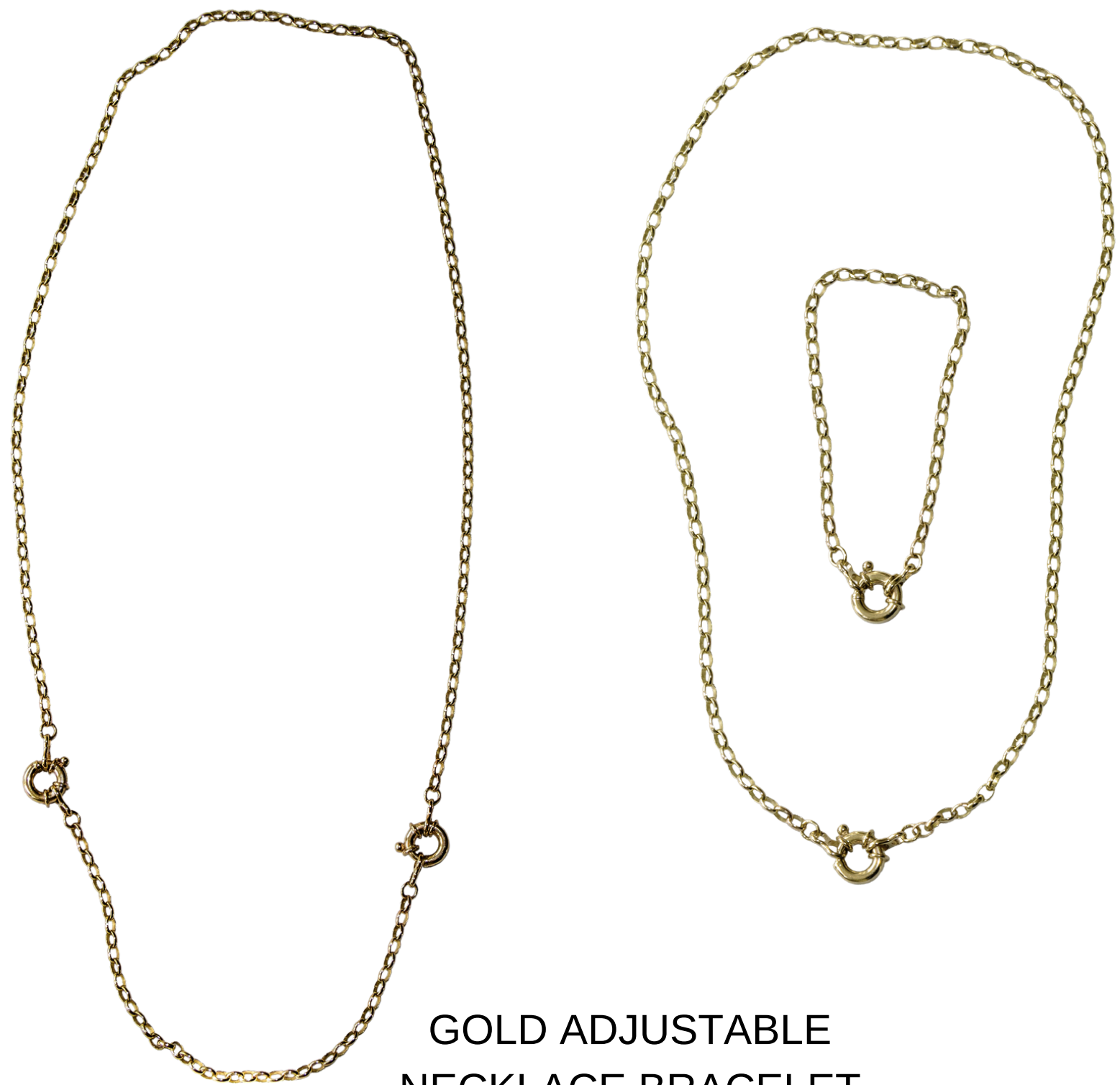
GOLD ADJUSTABLE NECKLACE BRACELET COMBINATION CHAIN