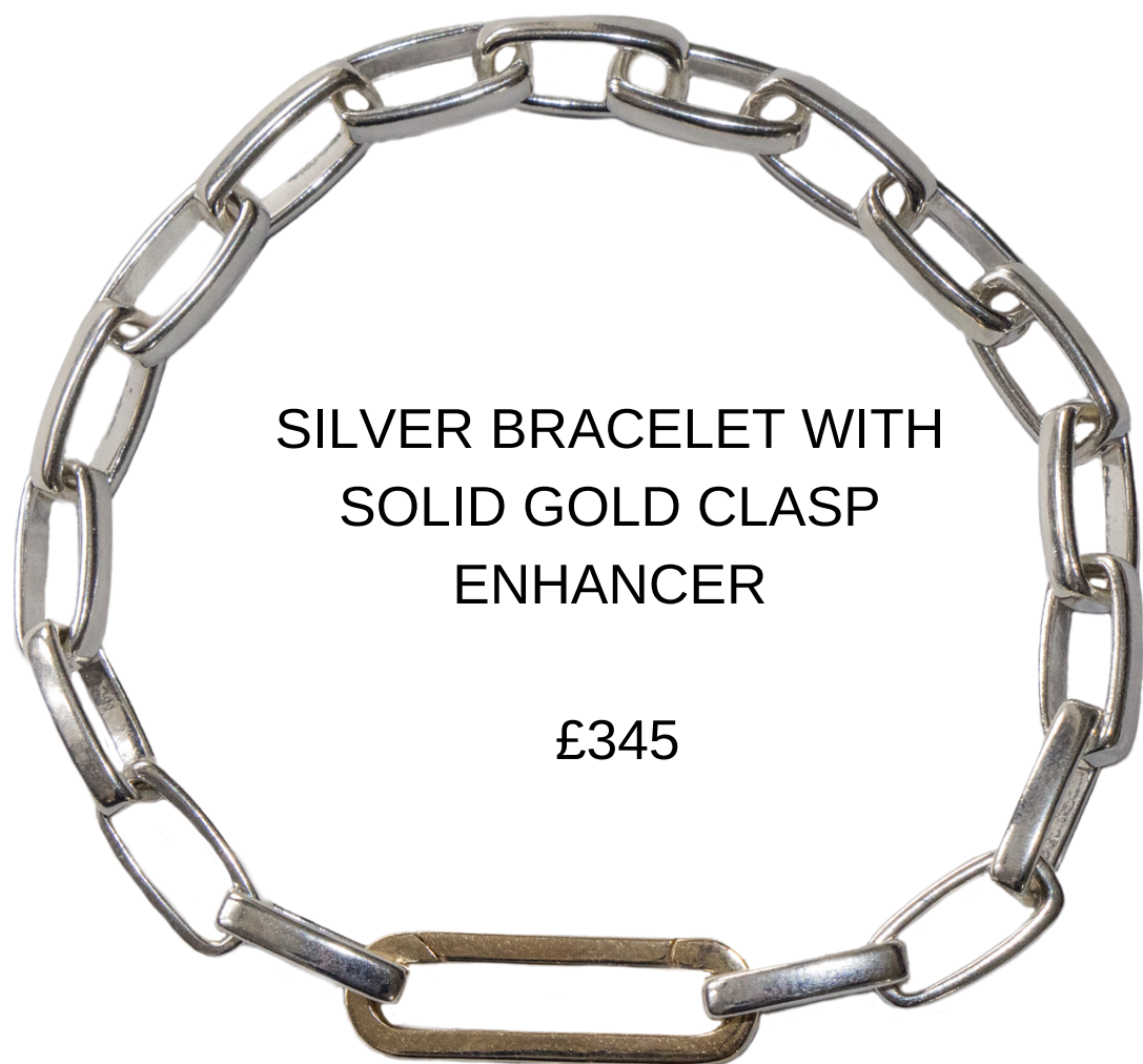
SILVER BRACELET WITH SOLID GOLD CLASP ENHANCER